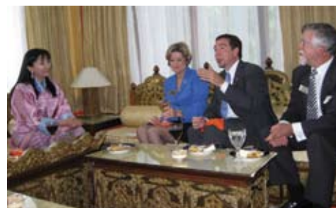
NBCC leaders meet with Queen Ashi Sangay Choden Wangchuck of Bhutan. See page 2 for full story.