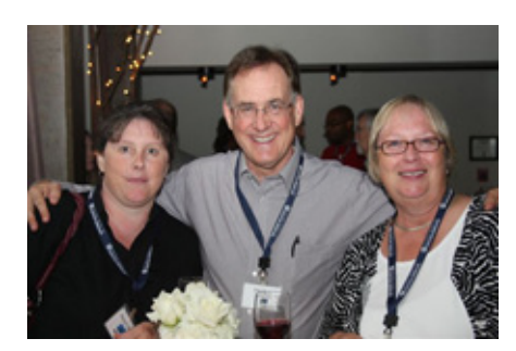
Representatives from Vermont and Kansas who attended the meeting.

To conclude the meeting, attendees traveled to the International Civil Rights Museum in downtown Greensboro for an informative and inspirational talk by