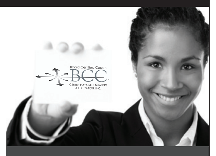
Apply for the BCC credential today. Visit www.cce-global.org/BCC.